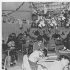
WE DECORATE FOR CHRISTMAS.