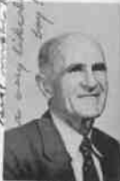
Best minister I ever knew a very likable boy! Ed. Entress