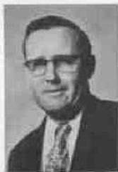
E. H. Rob Elementary Principal