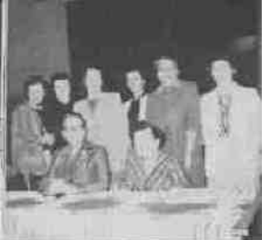
The P. T. A. Club, Inc.