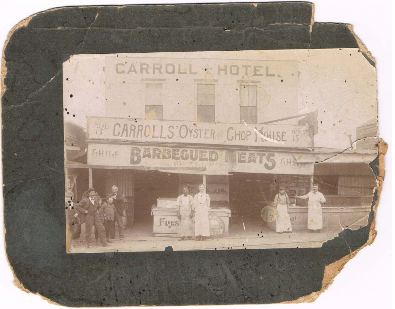
Figure 8 - Carroll Hotel: Feb 10 1900