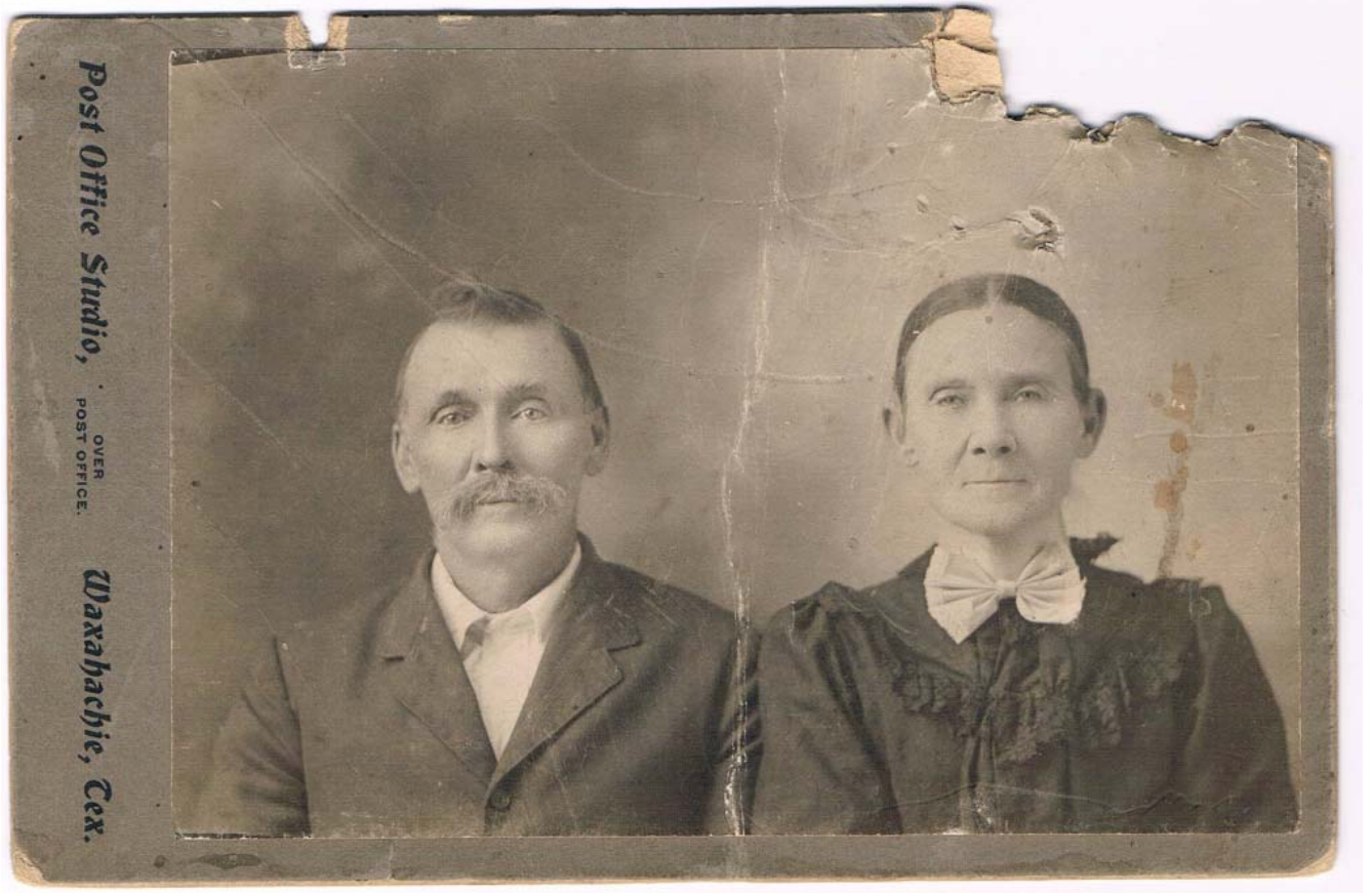
Figure 33 - Unnamed 19:

(Possibly George Washington Stephens based on family resemblance alone.)