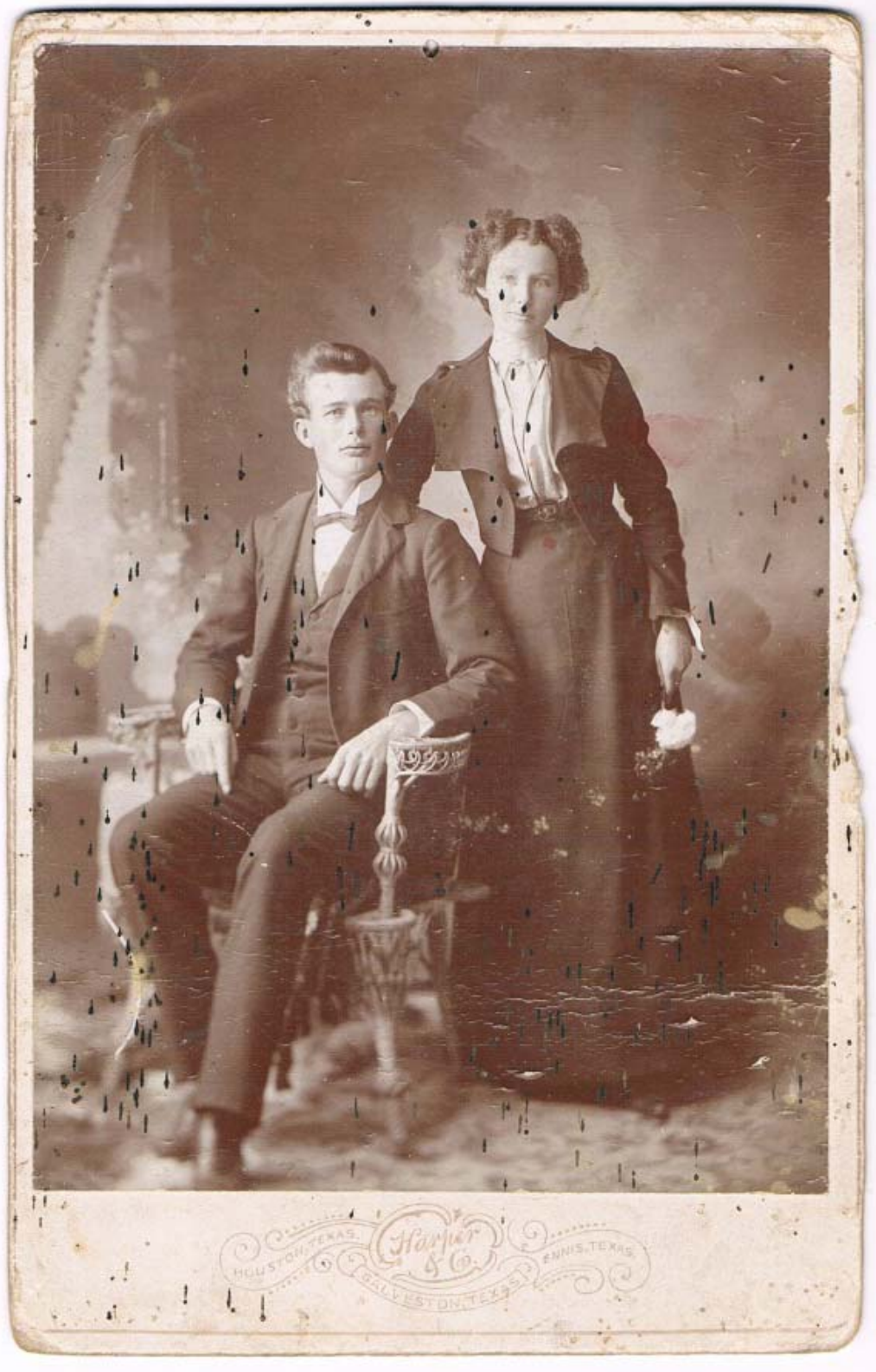
Figure 29 - Unnamed 15: