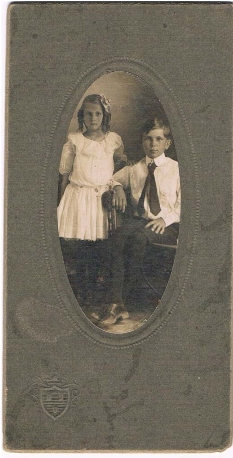
Figure 21 - Unnamed 7: