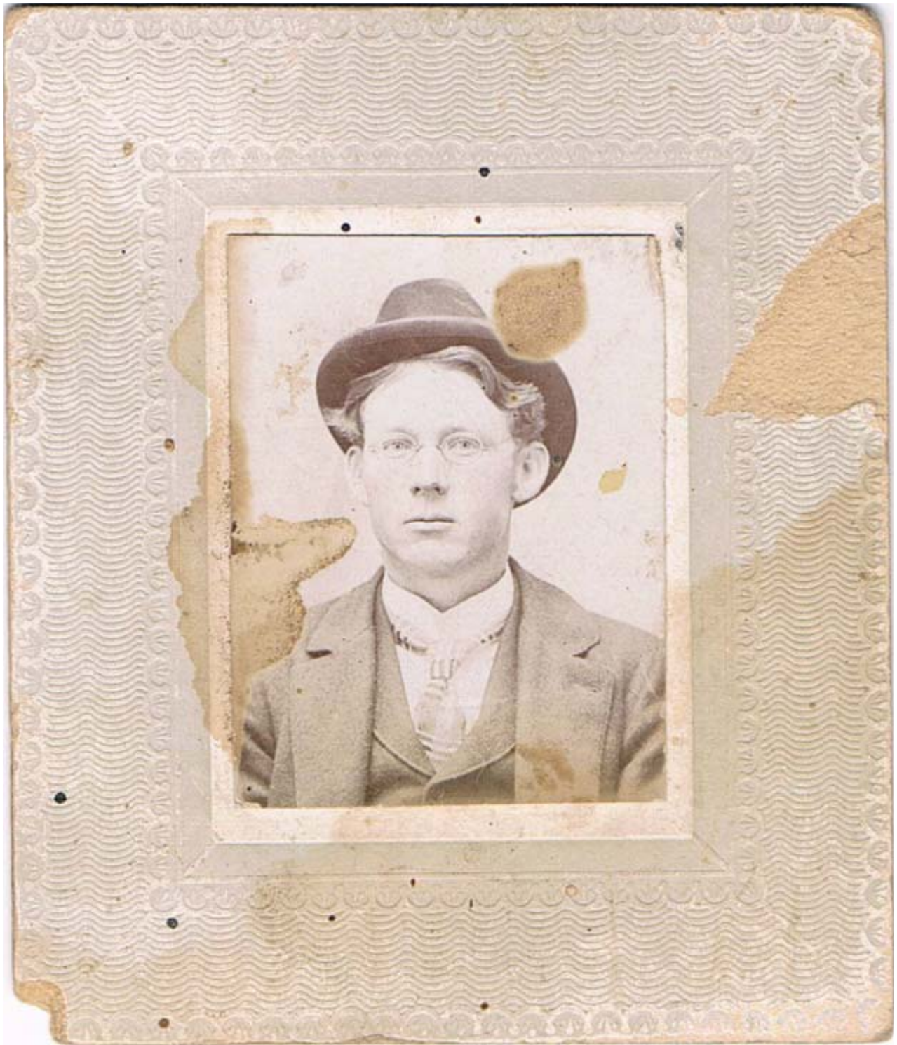
Figure 17 - Unnamed 3:

(Possibly John Henry Stephens based on resemblance alone.)