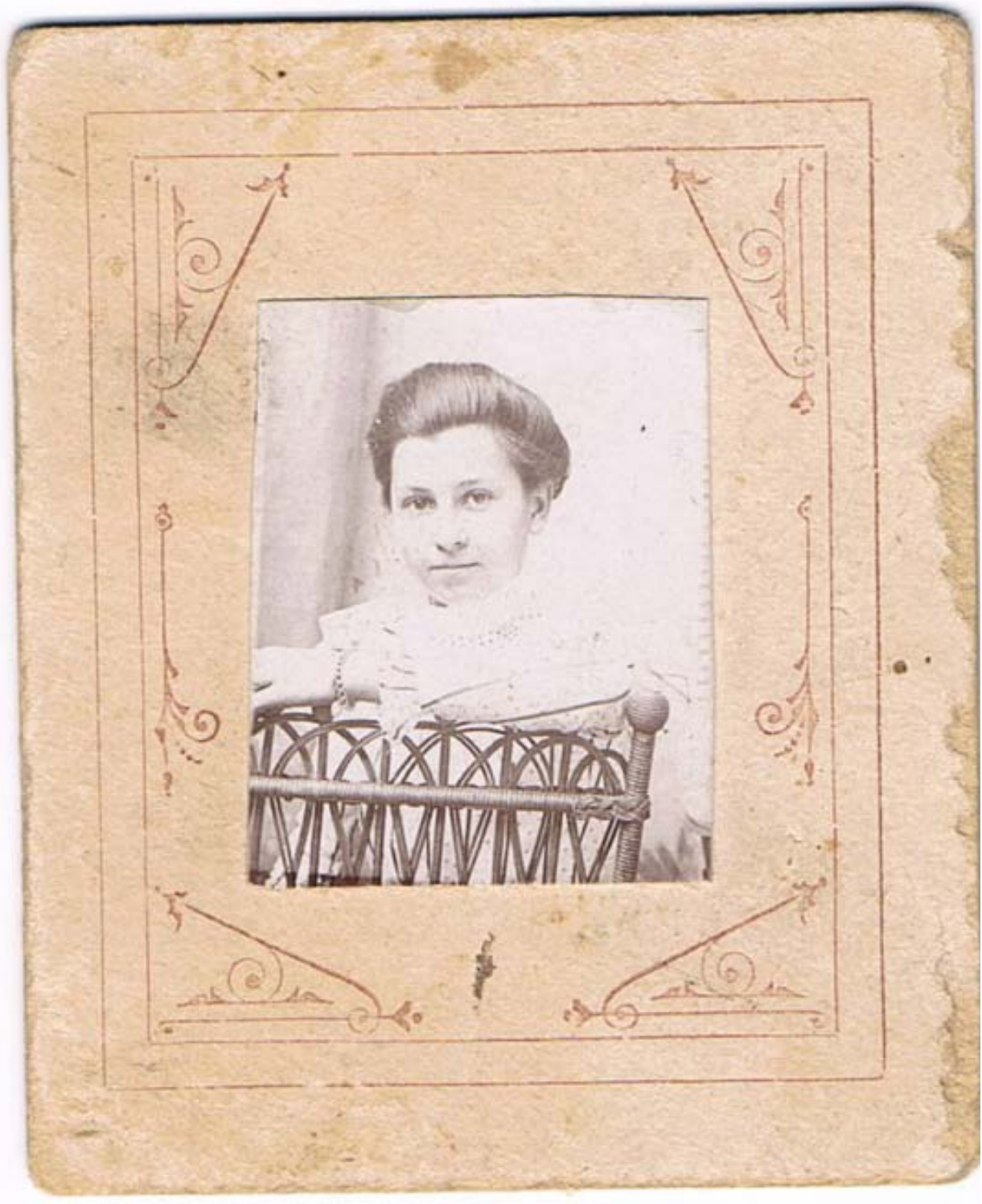
Figure 18 - Unnamed 4:

(Possibly woman pictured in Figure 28 based on resemblance alone.)