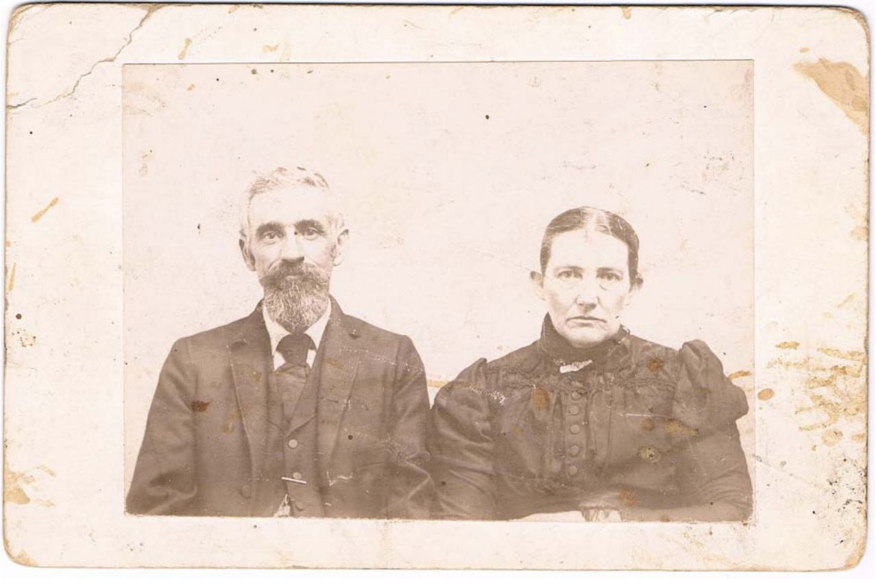
Figure 31 - Unnamed 17: