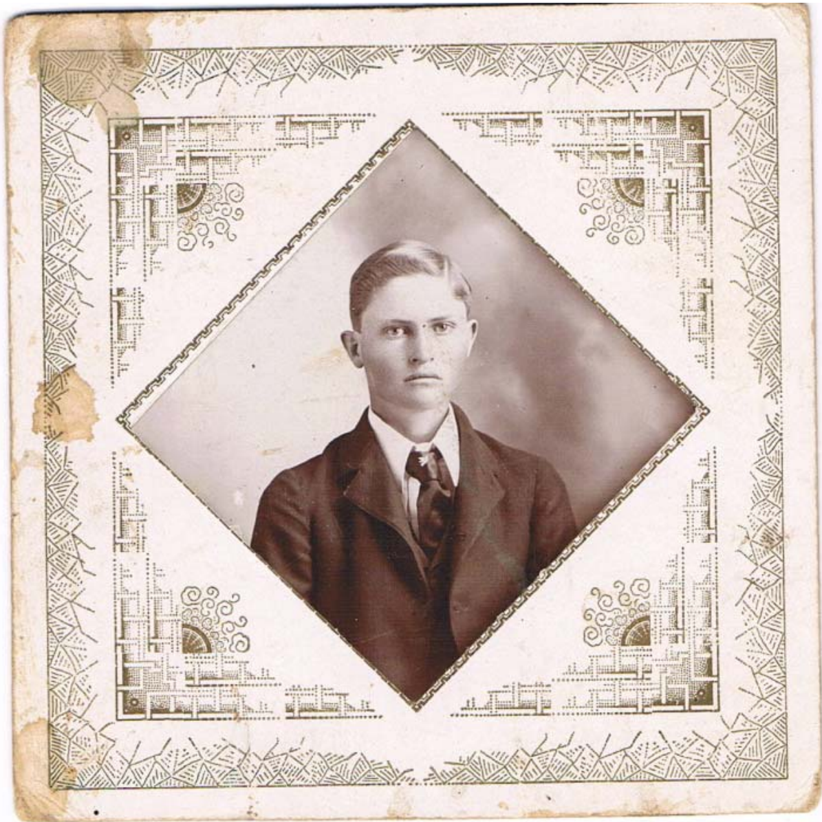
Figure 19 - Unnamed 5: Devenport/ the Photographer/ Waxahachie