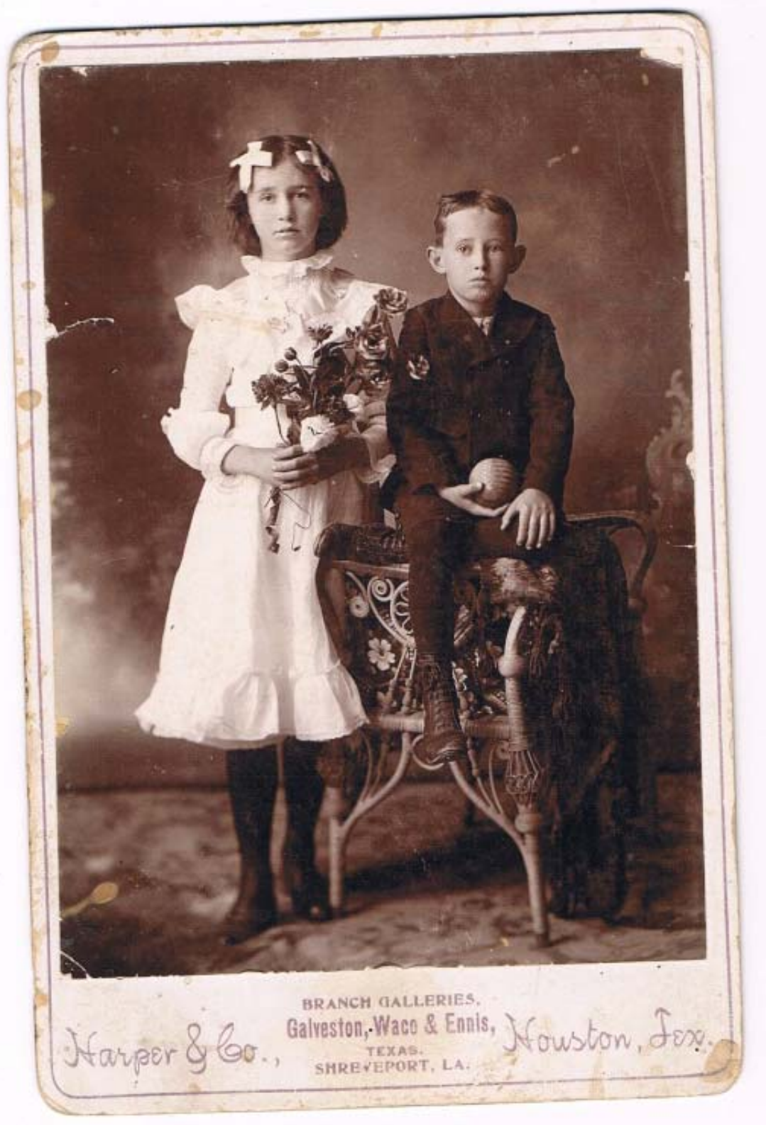
Figure 27 - Unnamed 13:

(Boy possibly man pictured in Figure 7 based on resemblance alone.)