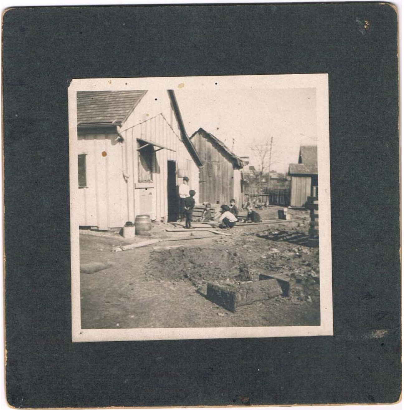
Figure 22 - Unnamed 8: