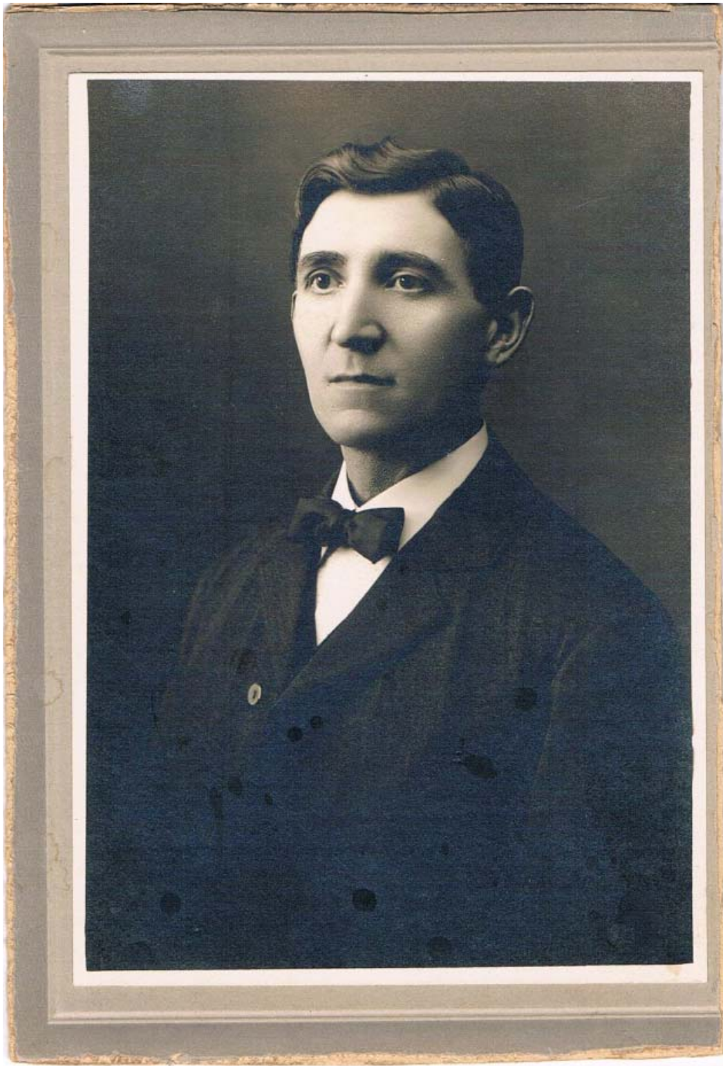
Figure 16 - Unnamed 2: