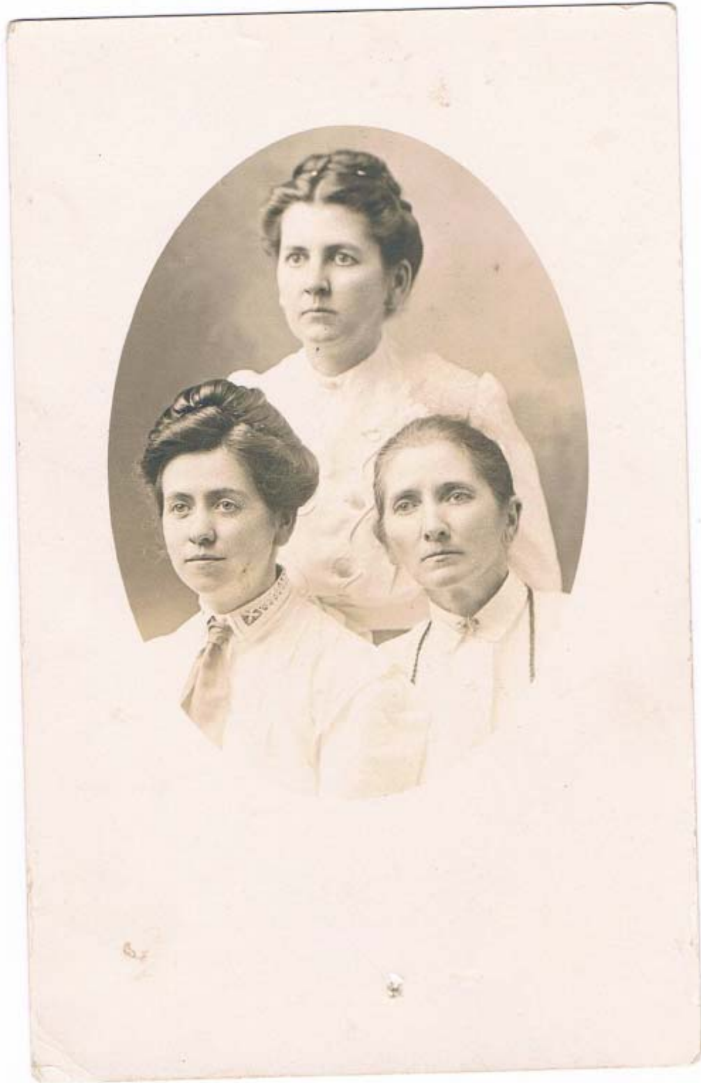
Figure 24 - Unnamed 10: