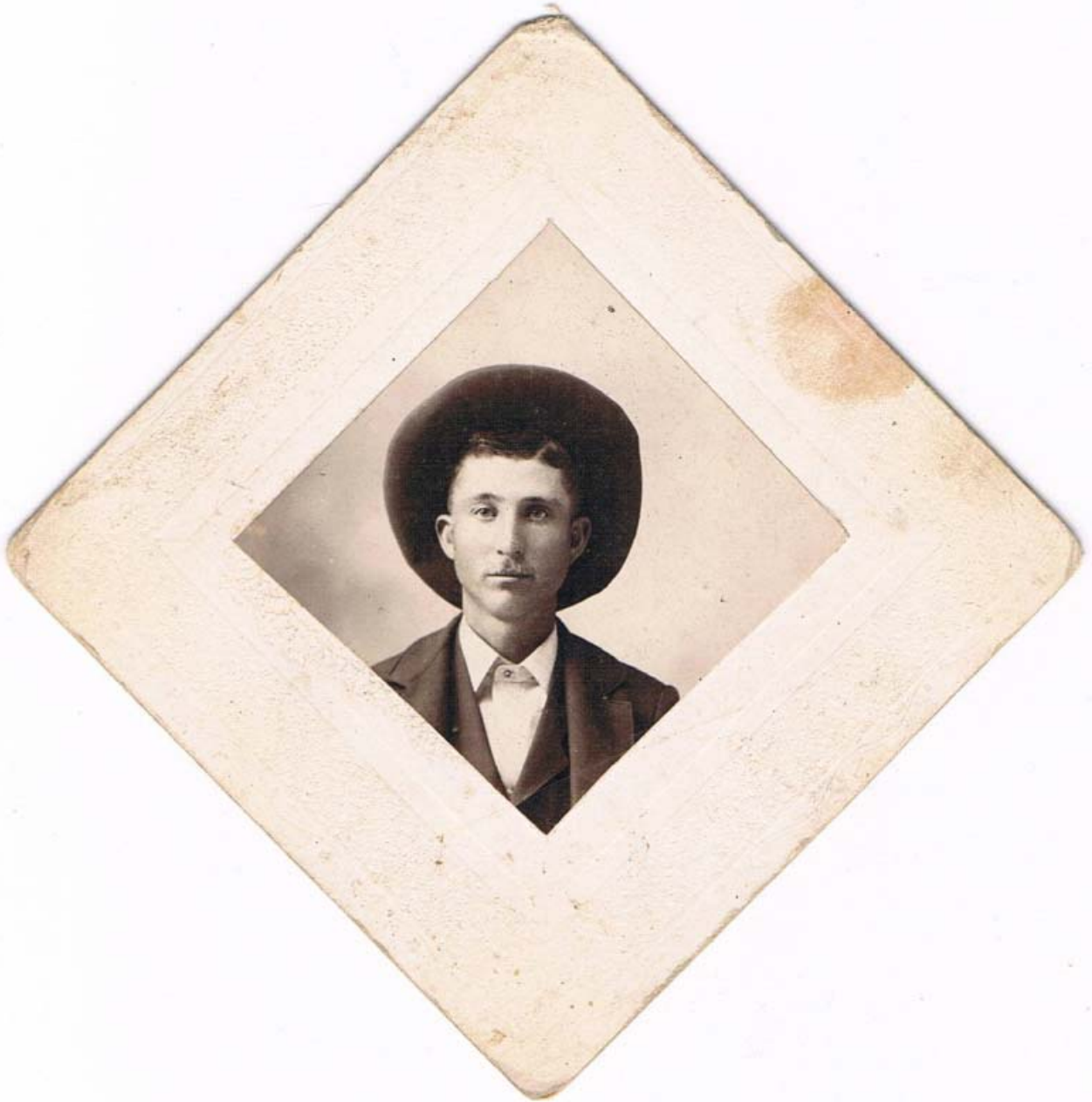
Figure 7 - Surface: T or F (faded name) Surface

(Possibly boy pictured in Figure 27 based on resemblance alone.)