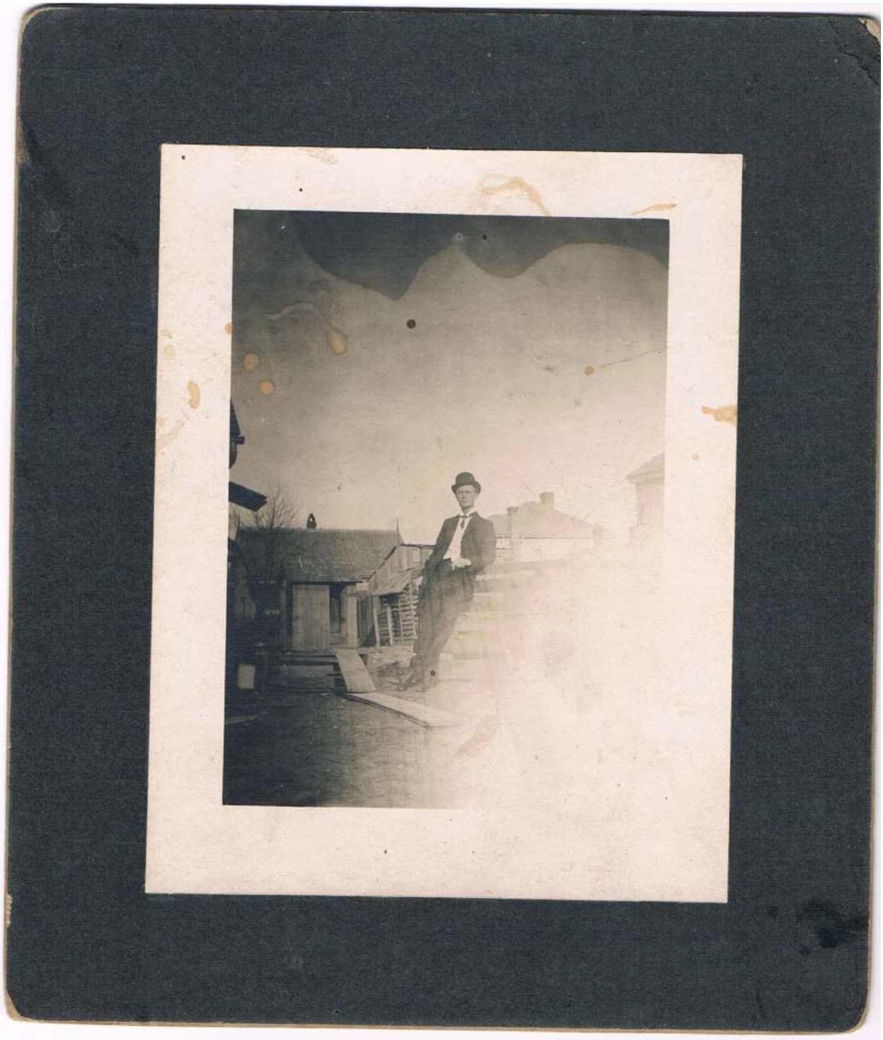
Figure 32 - Unnamed 18: