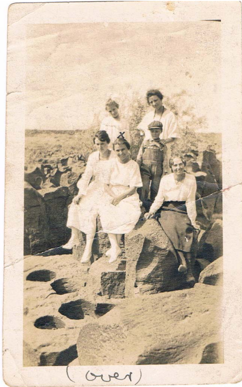
Figure 15 - Unnamed 1: That is my sister with the cross over her head the rest is my cousins That is me standing up with the beads on.

Format (Figure # - File name: Info written on back, as it appears on photo)