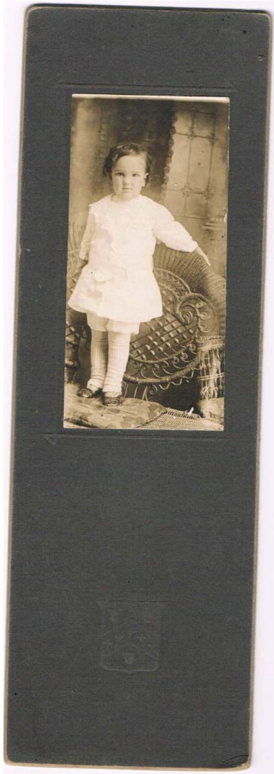
Figure 26 - Unnamed 12: