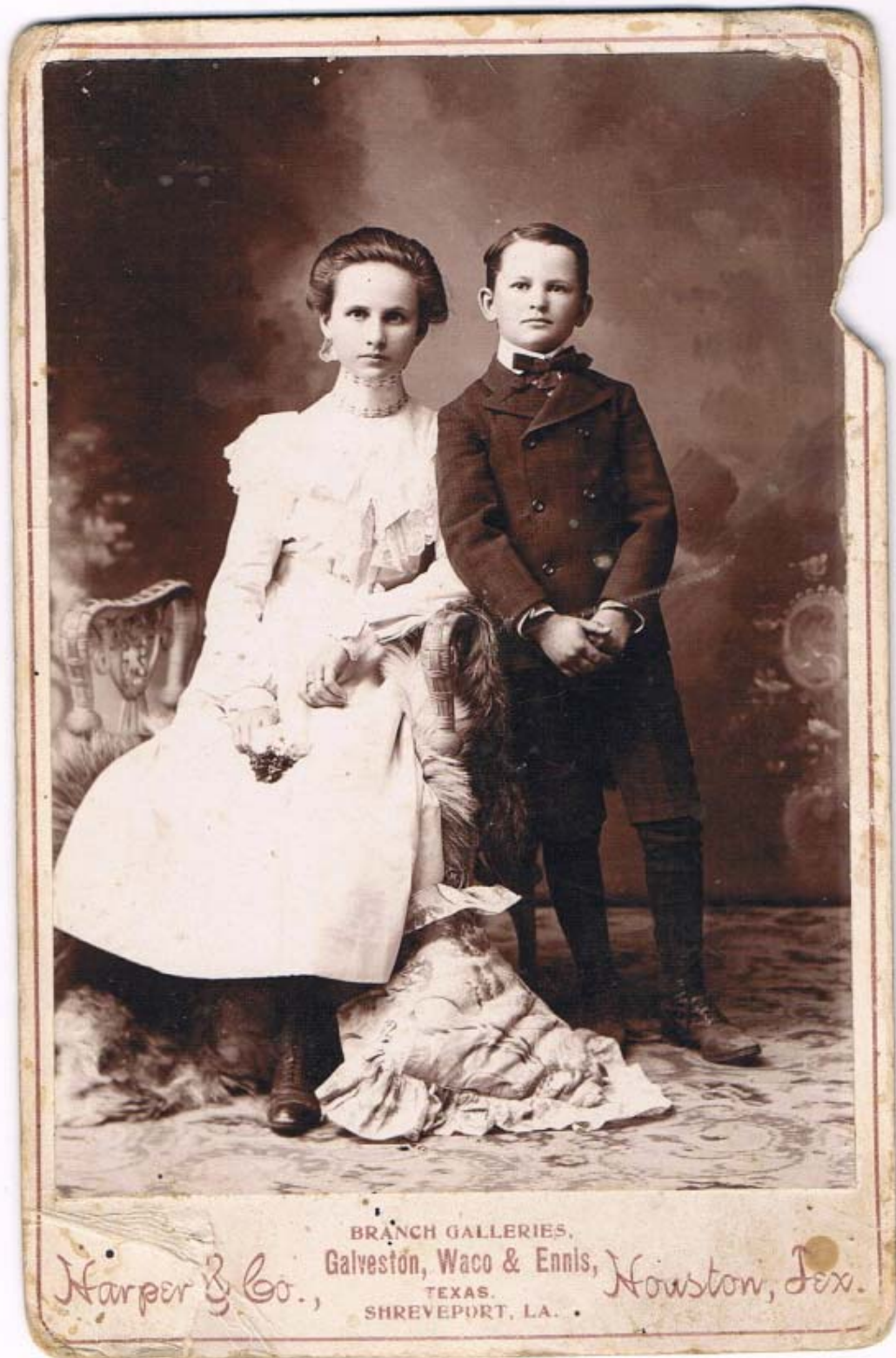
Figure 28 - Unnamed 14:

(Possibly woman pictured in Figure 18 based on resemblance alone.)