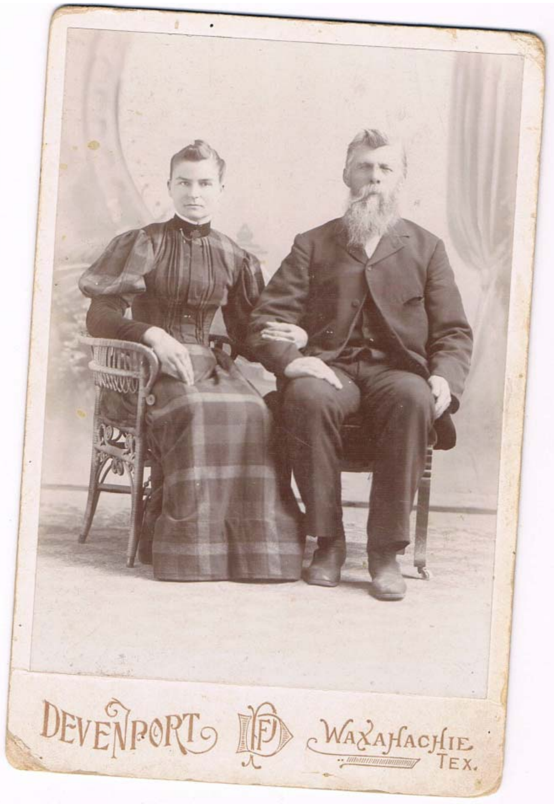
Figure 30 - Unnamed 16: