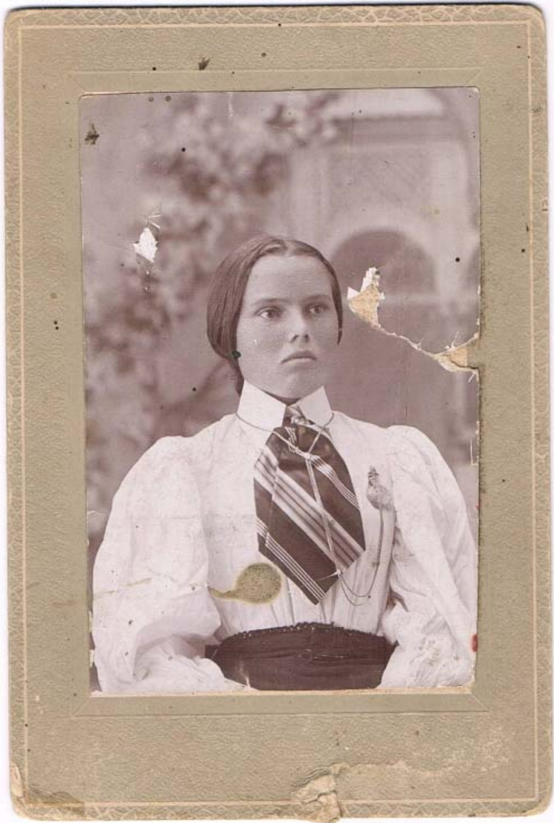
Figure 20 - Unnamed 6: