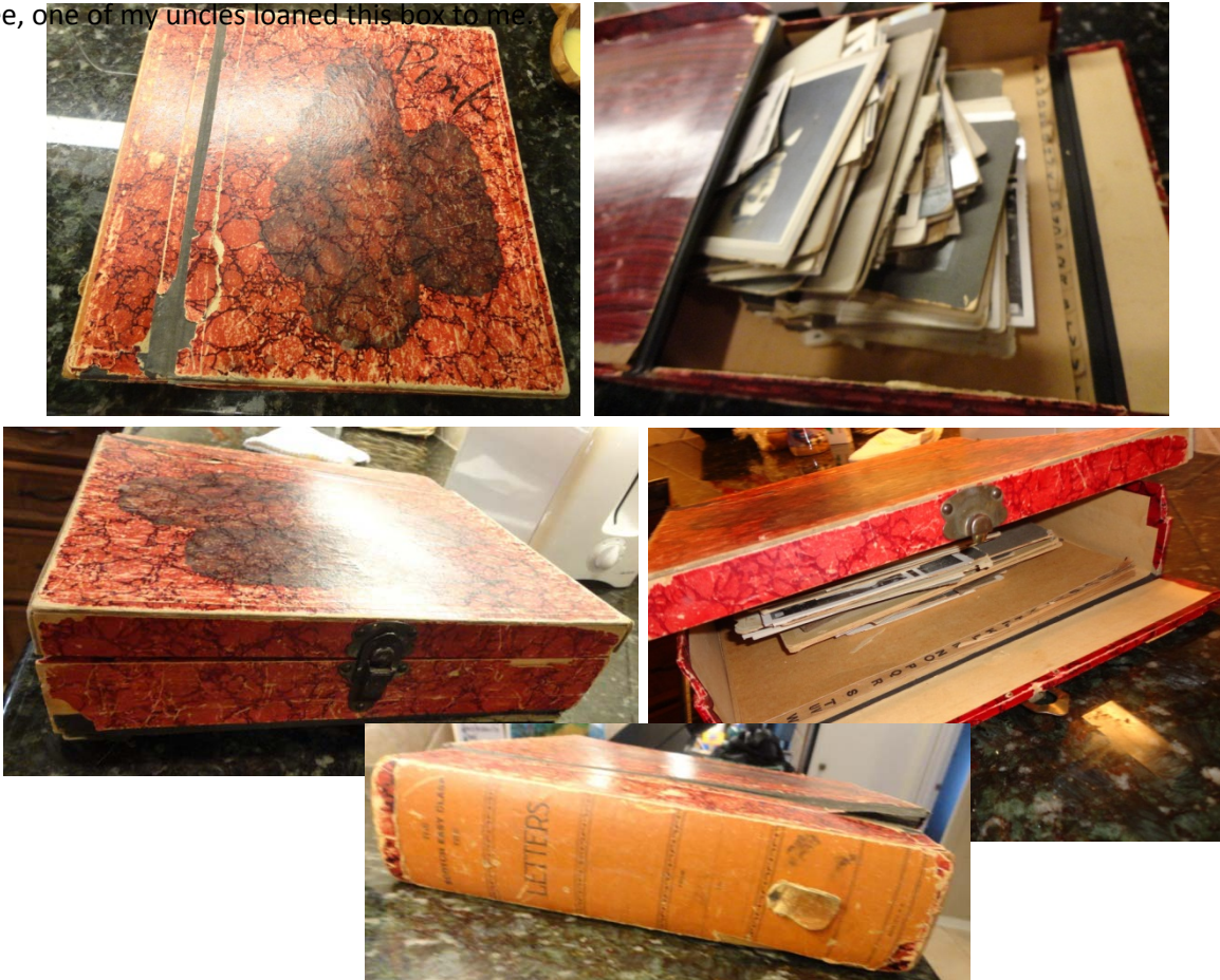
Figure 1 – "Pink" Box