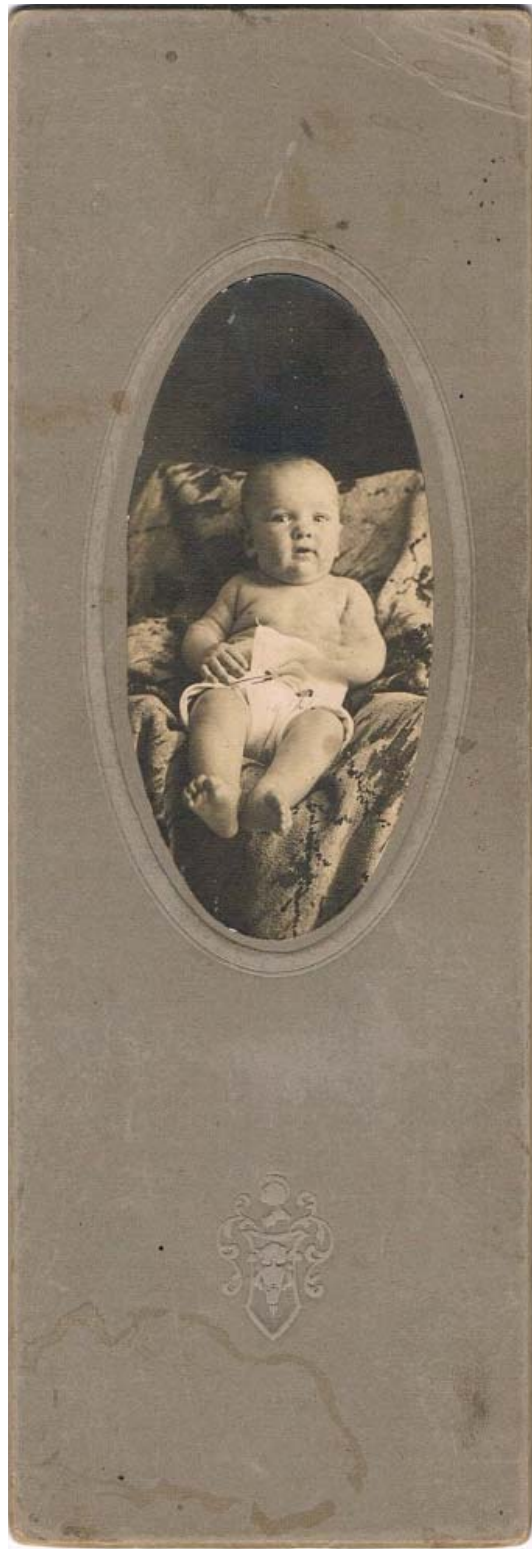
Figure 25 - Unnamed 11: