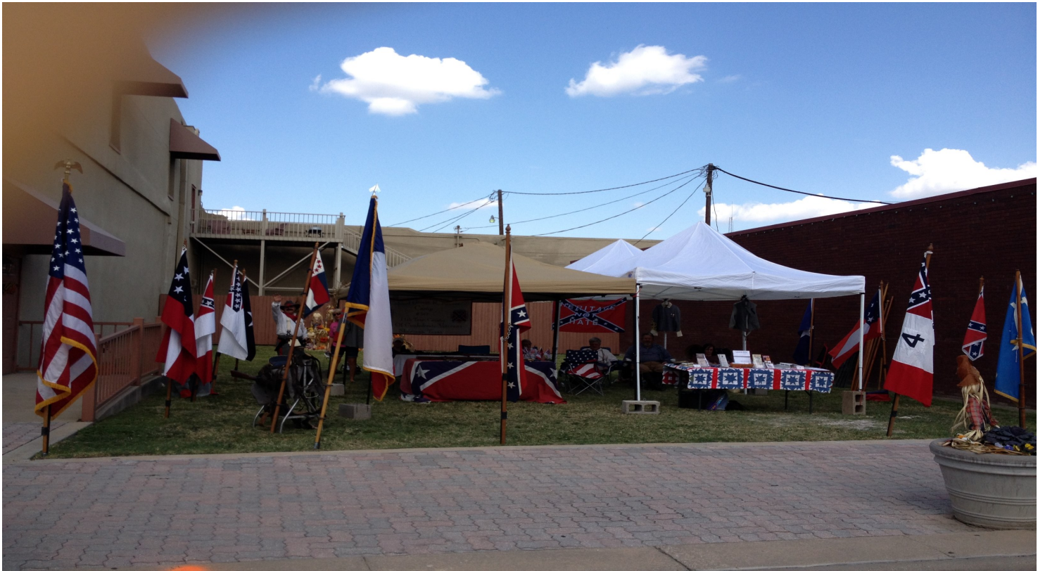
Depot Days October 12, 2013