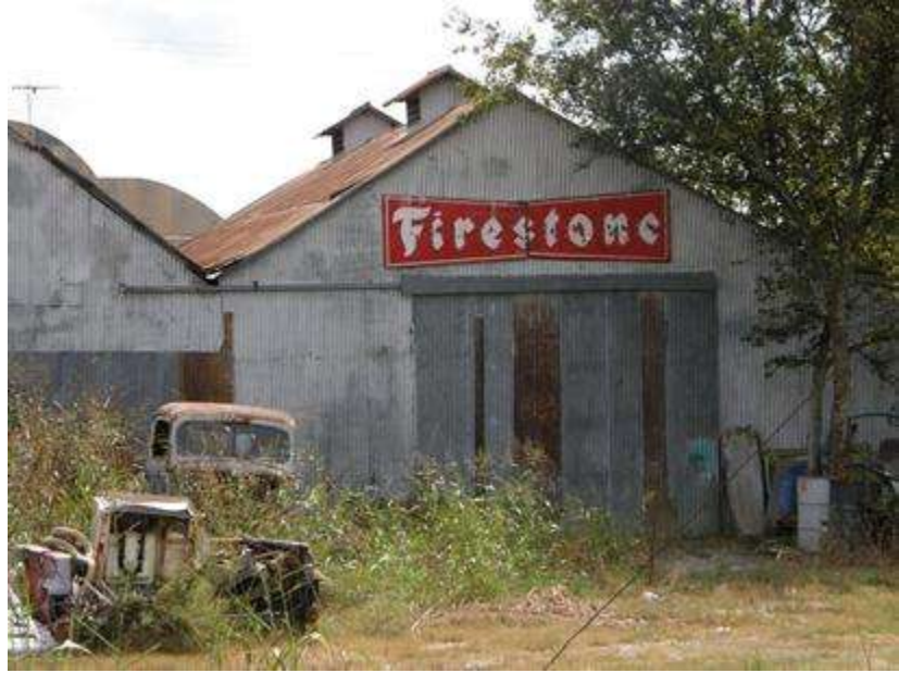
TE photo, October 2007