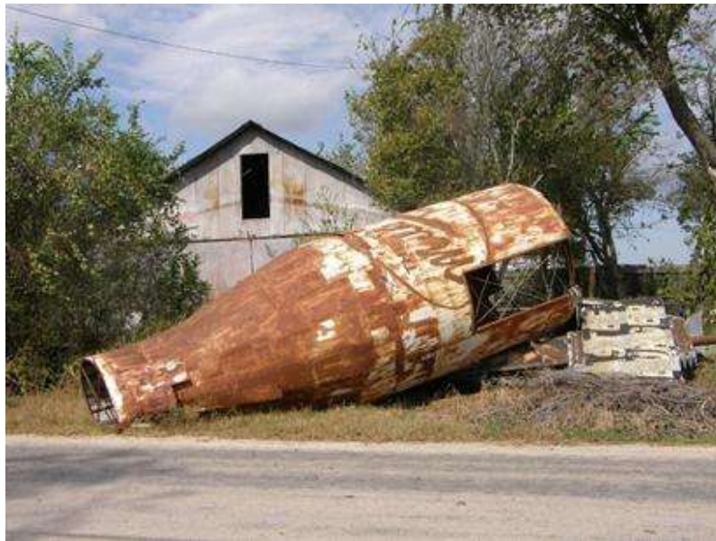
The prop from the office of the Milk Bottle Motel featured in the movie 'Michael' filmed in Utley Texas. October 2007

Caldwell County, Central Texas South On the Hays County Line Hwy 21 and FM 2720 7 miles NW of Lockhart 3 miles SW of Neiderwald 11 miles NE of Caldwell Population: 386 (2000)