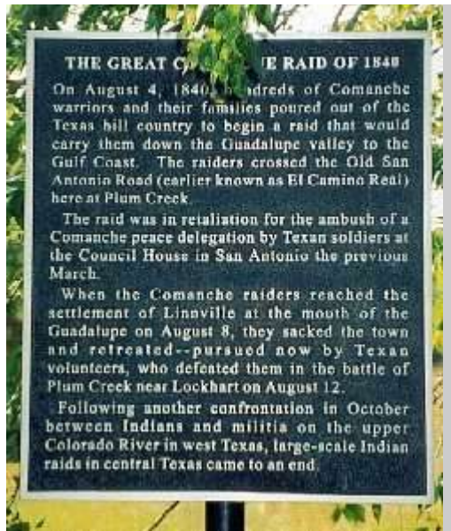
The Great Comanche Raid Historical Marker TE photo, 2001

A marker showing where the Comanche's crossed on their way to the coast during the Comanche Raid of 1840 is found just south of the former downtown Umland.