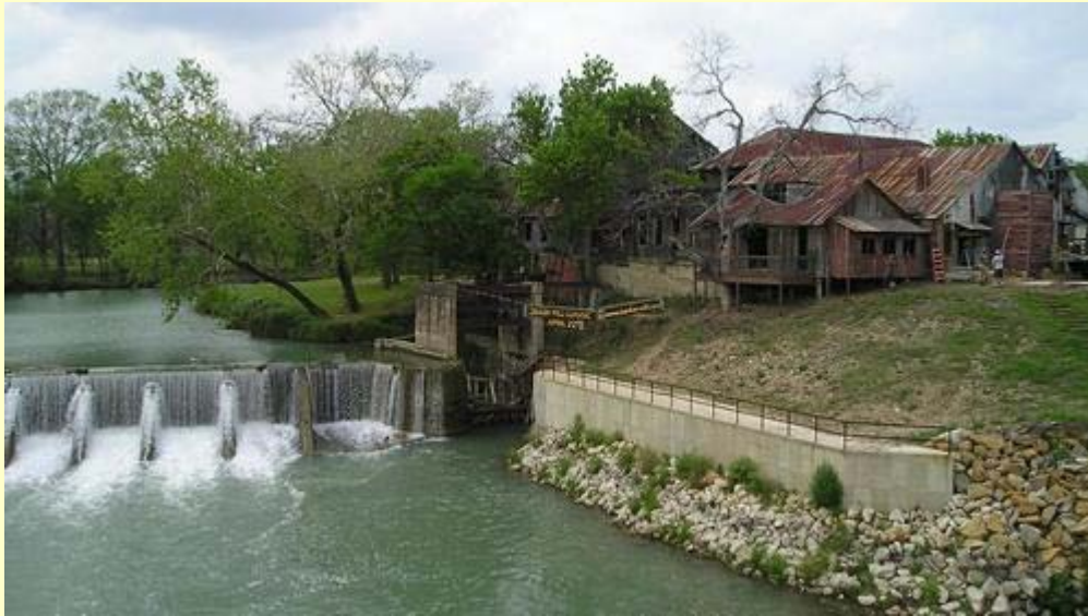
After nearly four decades, Zedler's Mills is revealed from Nature's green cloak.