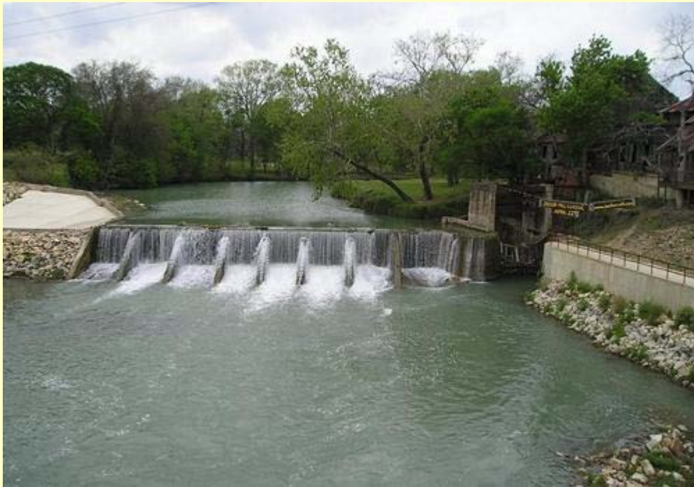
The dam at Zedler's Mills in March 2006