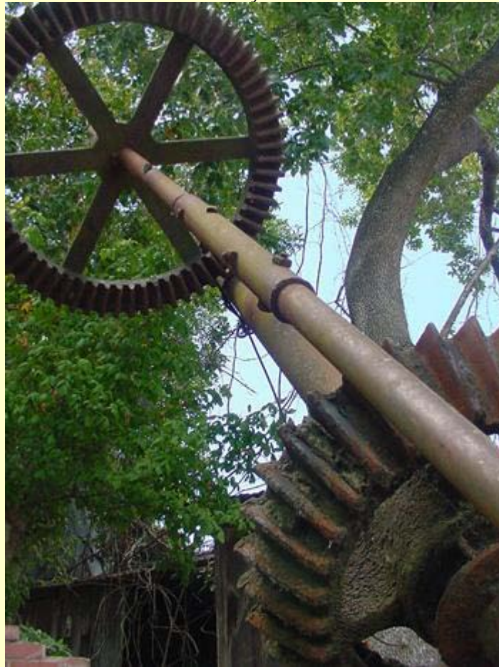
Original machinery at the mill run. TE Photo August 2006