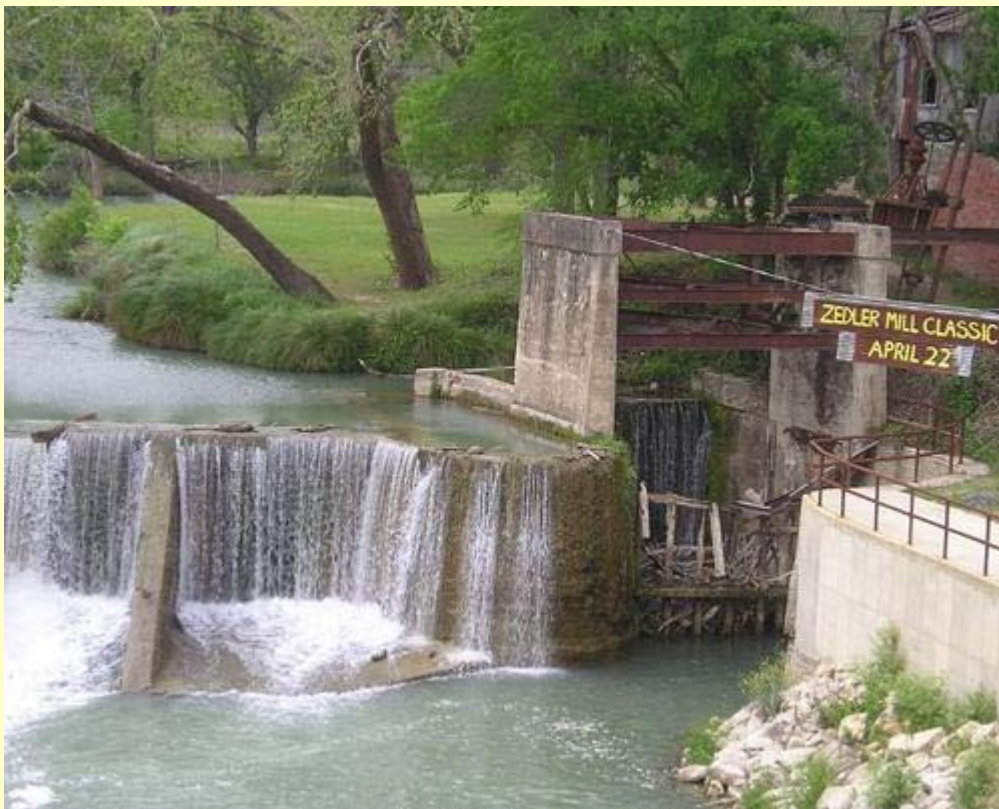
The "business end" of the mill.