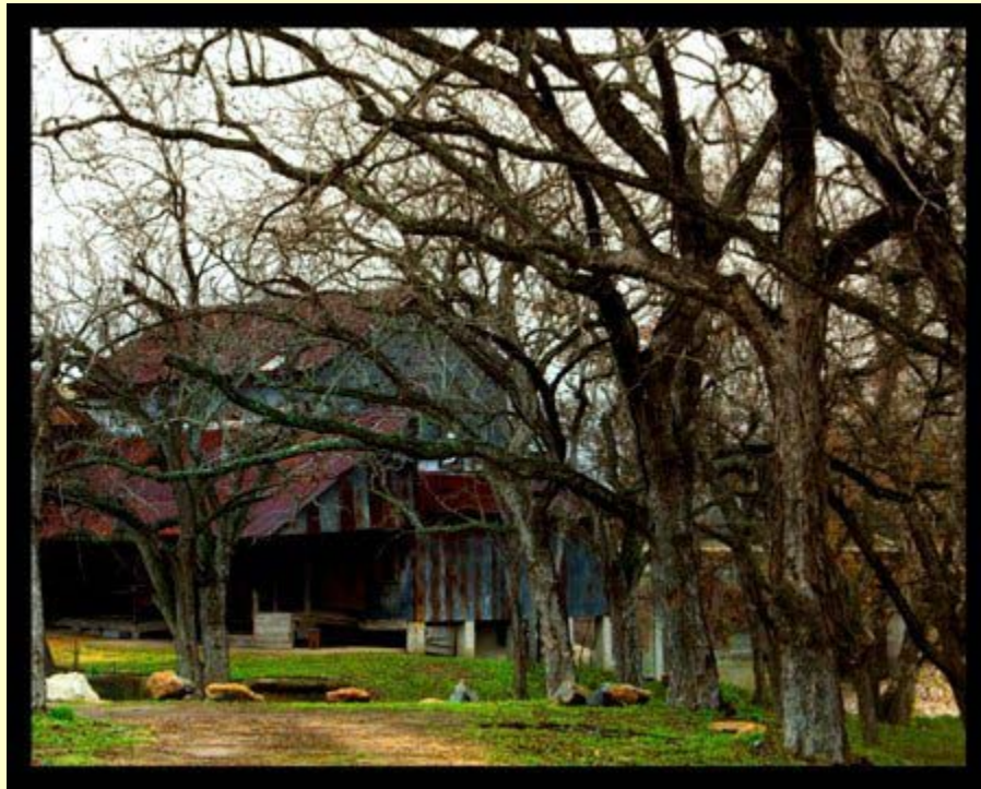
The largest building on the site in January '07