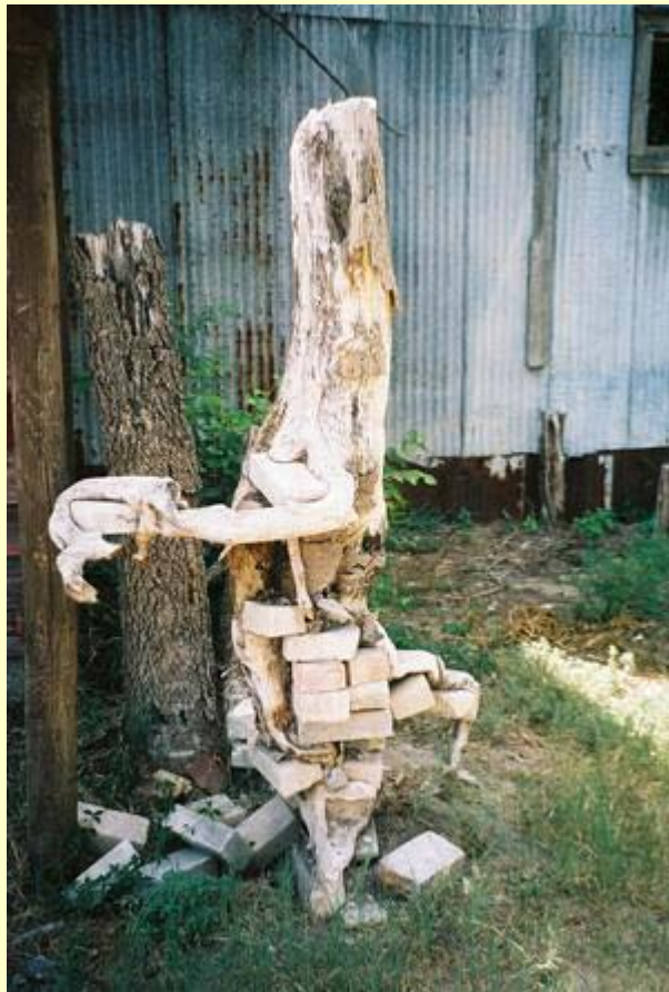
lighting. 55 Gallon drum (left) acted as an over-sized radiator.