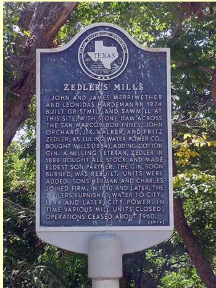
The historical marker TE Photo

Photos taken in March 2006 on 80 just south of Luling – Sarah Reveley, October 28, 2007