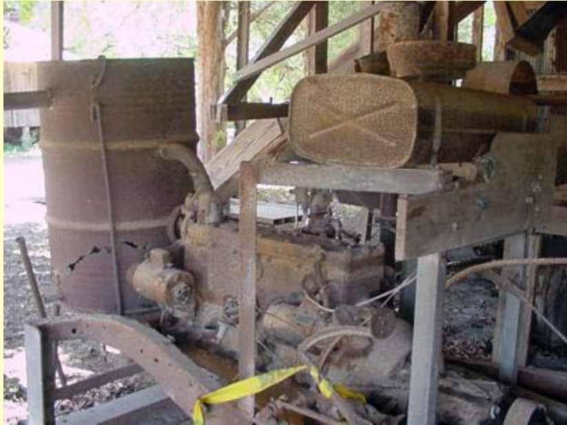
An adapted Model T chassis provided power - perhaps for the mill's