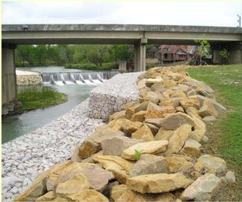
The cycle begins again: A sprout appears on the flood-control retaining walls.