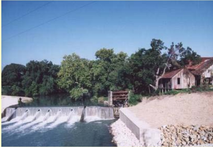
The mill in 2004, before installation of the steps Photo courtesy Barclay Gibson, September 2004