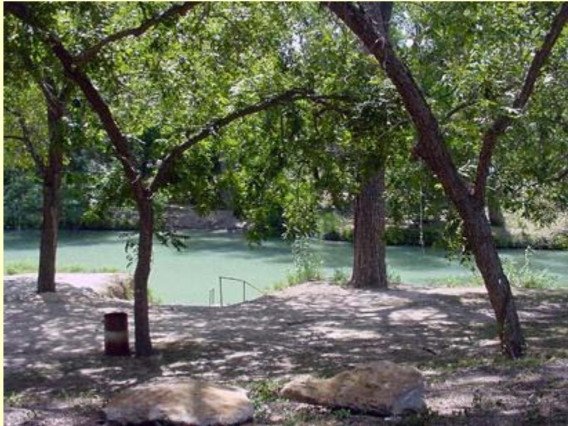
Designated swimming hole on the San Marcos River August 2006