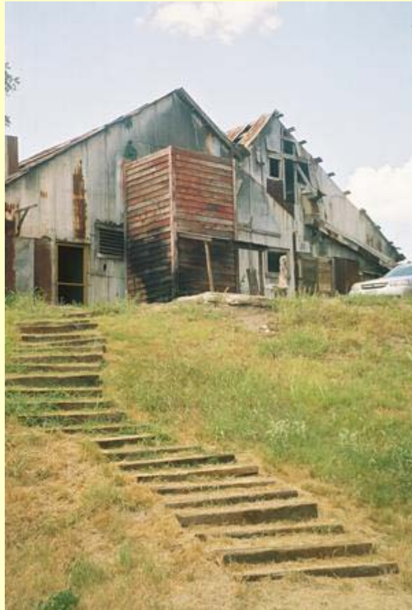
Photo Courtesy Chia-Wei Wang, August 2006 Steps leading down to the San Marcos River - or up to the Mill Photo Courtesy Chia-Wei Wang, August 2006

The root system of a long-dead tree embraces an old brick wall.