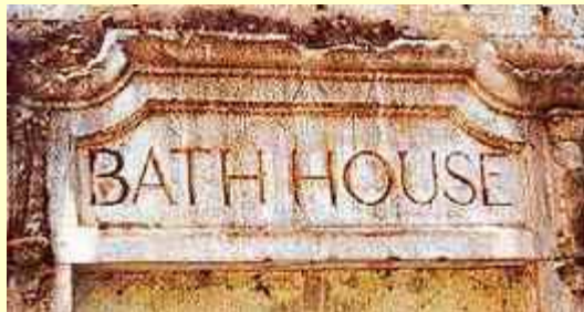
The inscription once again sees the light of day

This modest, yet noble structure sits on the recently overdrawn banks of the San Marcos River just south of Luling. It has a lot to be modest about, being a simple child's drawing of a building, now without a roof. The only thing now noble about it is the inscription BATHHOUSE carved above the door.