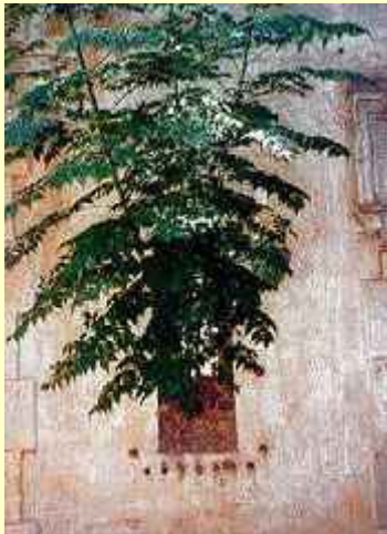
Chinaberries sprouting from the windows

The people who play golf are used to aggravation, but eyesores they can't stand. So they came up with a plan to bury the bathhouse. It was done in no time at all and soon looked like a Mayan pyramid (to a lesser diety). Weeds sprouted on the mound, but they were green at least and sometimes they appeared healthier than the course's landscaping.