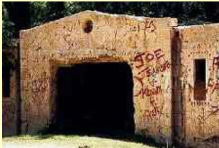
The recently unearthed bathhouse

Lulingites will devise a flood-proof stairwell to facilitate access to the river from the little Bathhouse that asked for a second (and third) chance. Besides, the broken glass has been swept away or at least has been worn smooth by now.