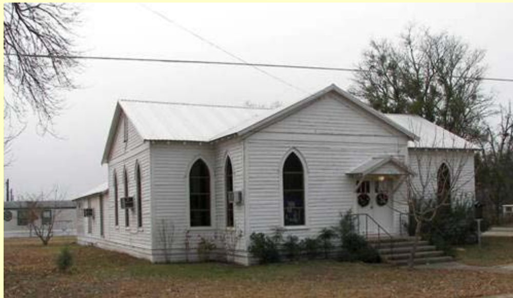
Fentress Methodist Church December 2006

The population was reported as 85 in 1990 and has since increased to 291 for the 2000 census.