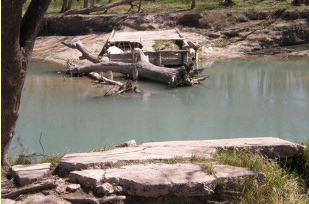
Remains of the old low-water crossing over the San Marcos River TE photo, March 2008