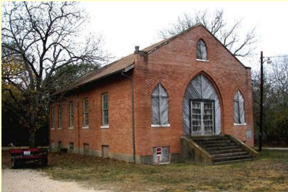
December 2006

Caldwell County, Central Texas S On the San Marcos River Highway 20 and Highway 80 8 Miles W of Luling 11 Miles SE of San Marcos 42 Miles S of Austin Population: 291 (2000)