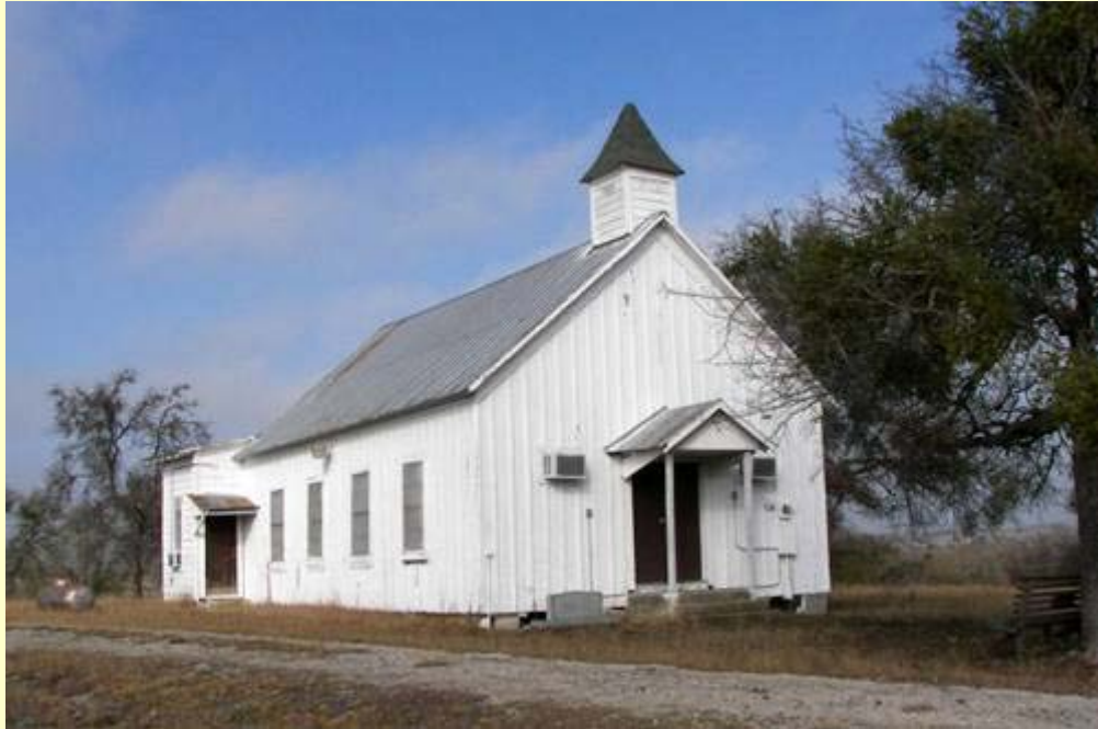
Clearview Baptist Church (just South of Fentress) Photo courtesy Barclay Gibson , December 2006