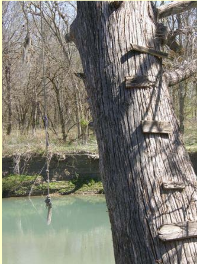
The old swimming hole TE photo, March 2008