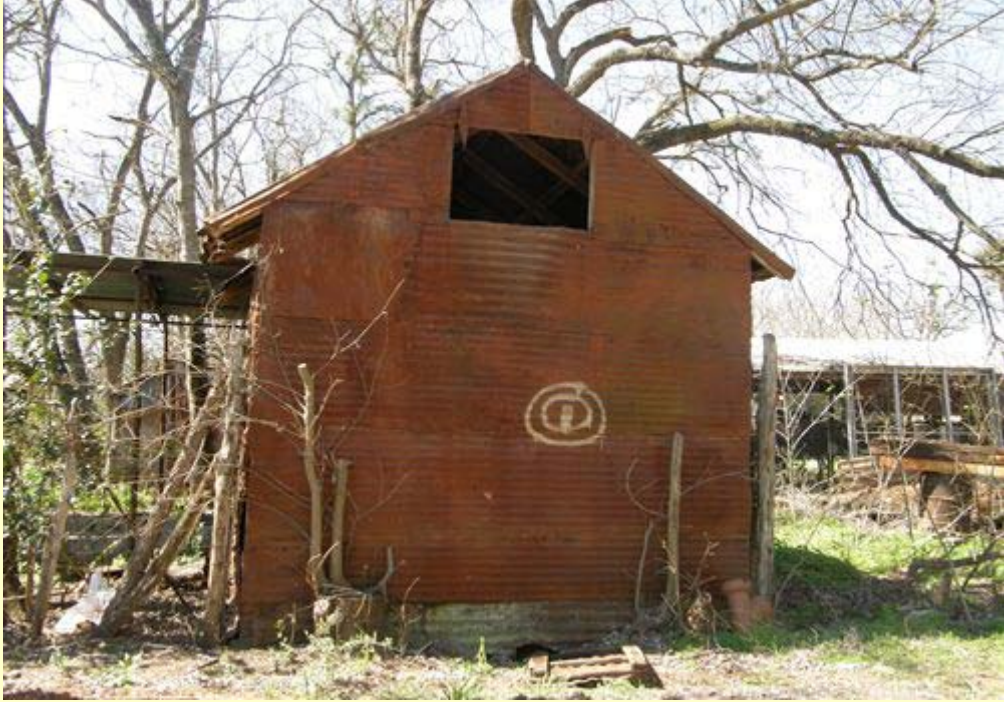
Mysterious Markings on Corrugated Iron TE photo, March 2008