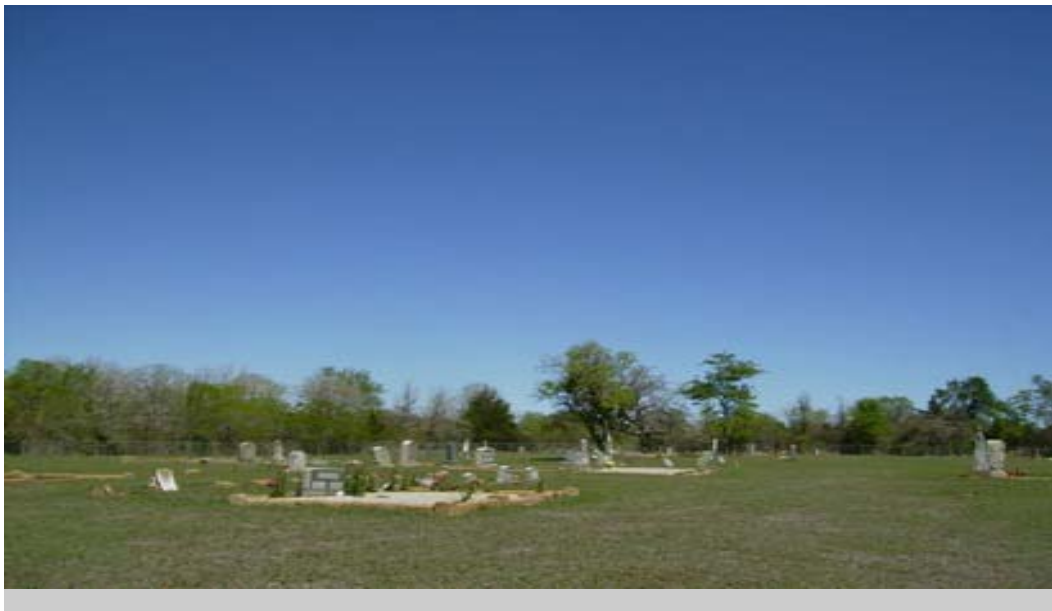
More Jeddo Cemetery scene Photo courtesy Sarah Reveley , 2009