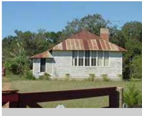
The old schoolhouse in Jeddo TE Photo, 10-03

Texas Ghost Town Bastrop County, Central Texas South FM 713 and 1296 9 miles S of Rosanky 18 miles from Bastrop (as the crow flies) Population: 25 (estimated)