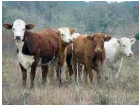
The Bovine Suspects