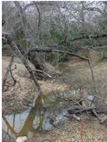
Peach Creek as viewed from the bridge