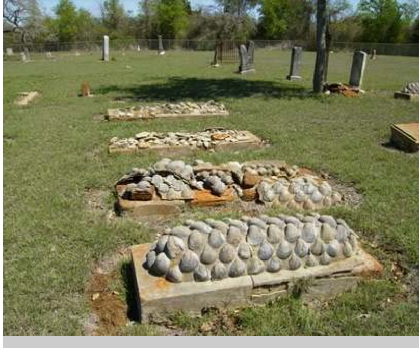
Graves in Jeddo Cemetery